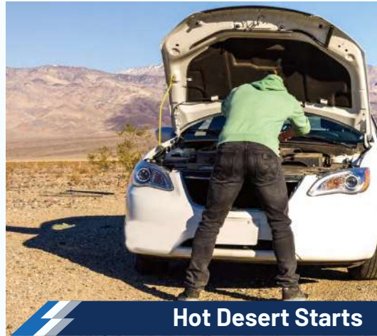
Hot Desert Starts