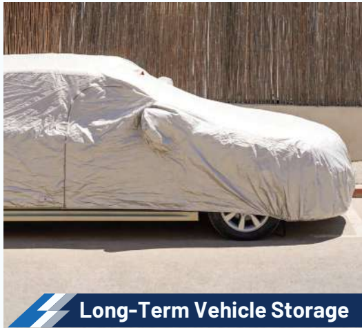
Long-Term Vehicle Storage