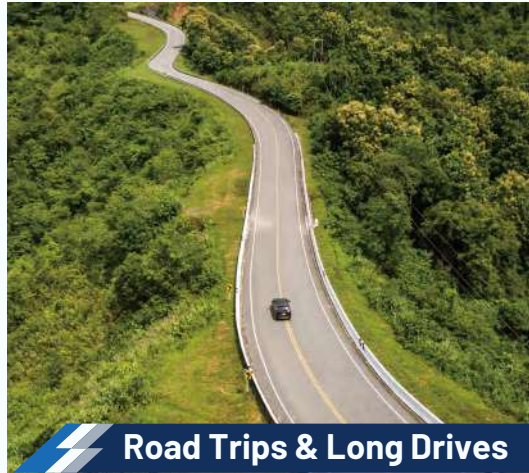
Road Trips & Long Drives