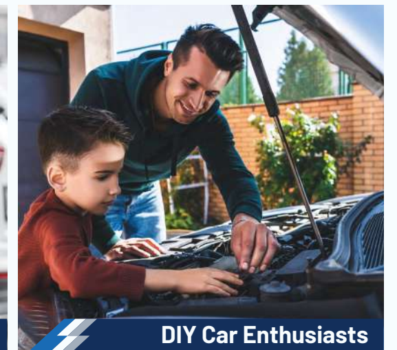
DIY Car Enthusiasts