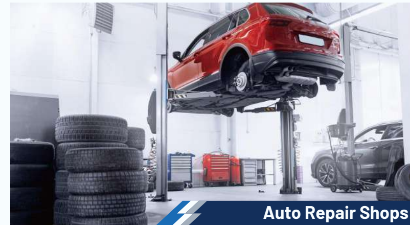
Auto Repair Shops