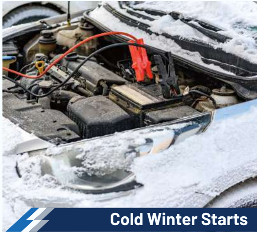
Cold Winter Starts